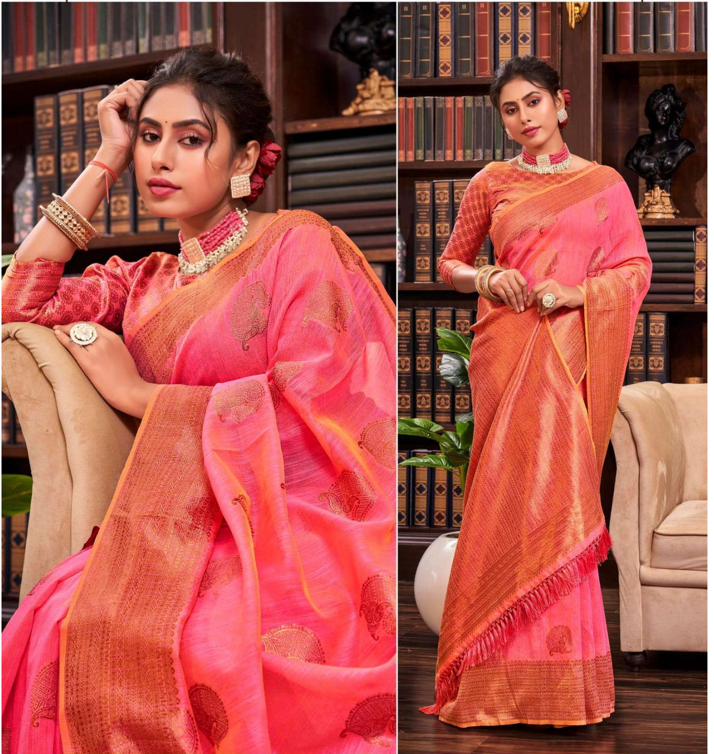
This enchanting ensemble is a vision of pure beauty and handcrafted finesse. With powder peach, green and pink floral embroidery over a flattering palette of peach and gold, this attire is one of the most beautiful pieces in the collection.