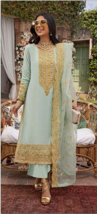
S - 88 A

Top - Fox georgette heavy embroidered with handwork Inner Bottom - Heavy santoon Dupatta - Nazneen heavy embroidered