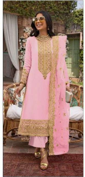
S - 88 D