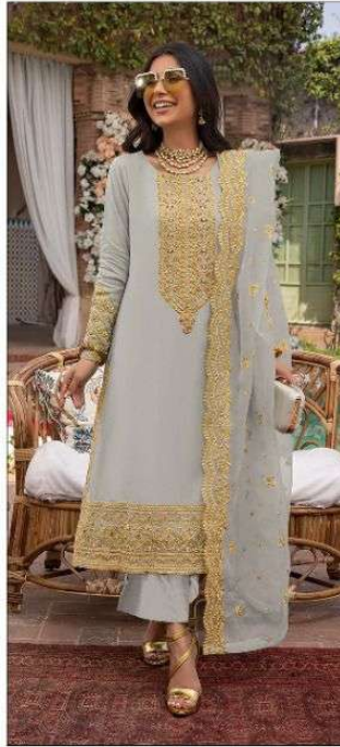
S - 88 C