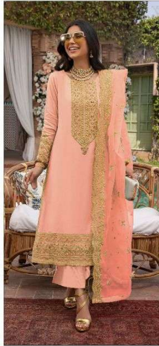
S - 88 B