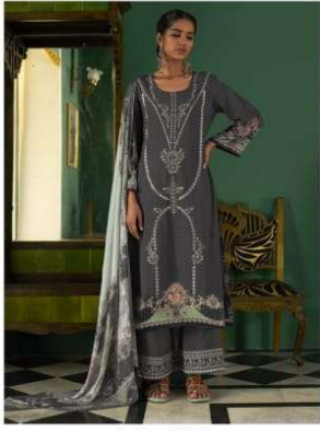
D. No. 8881