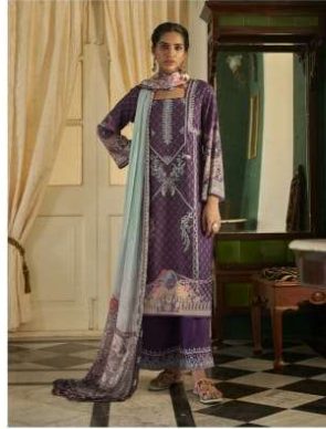
D. No. 8884