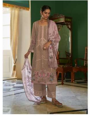
D. No. 8886