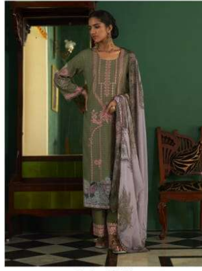
D. No. 8882