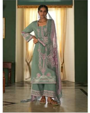
D. No. 8888