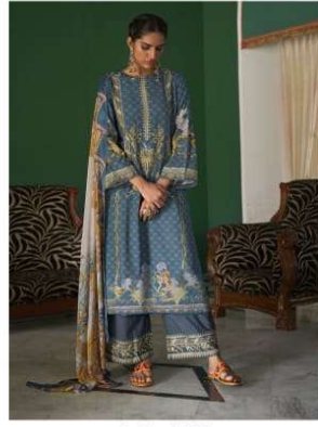
D. No. 8885