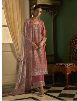
D. No. 8887