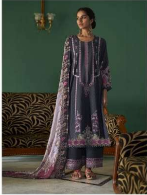
D. No. 8883