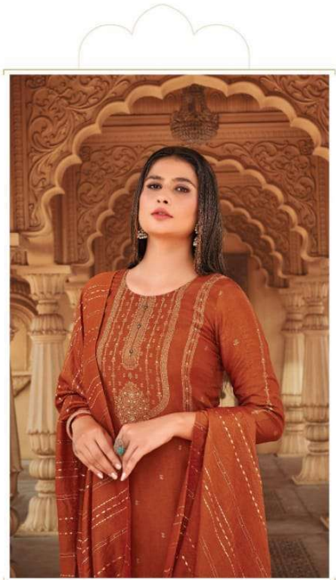
Classic style with luxurious softness highlighted by refined and feminine details