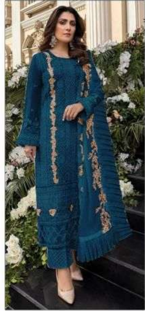
S 50 Z