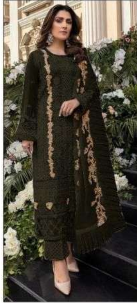
S 50 Y