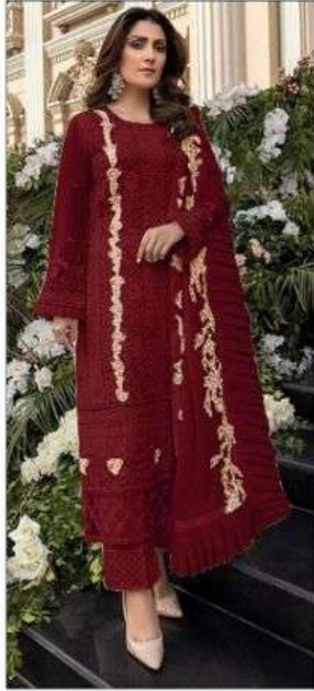
S 50 X