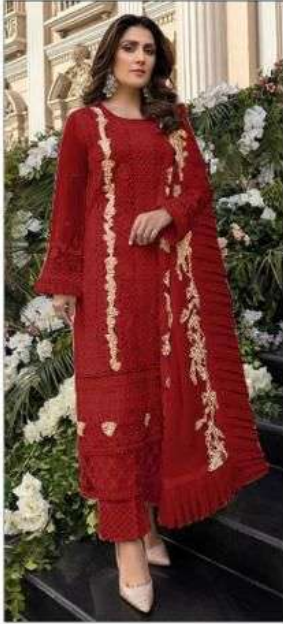
S 50 W