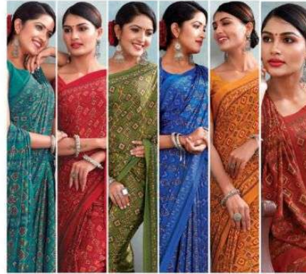
10005A 10005B 10005C 10005D 10005E 10005F