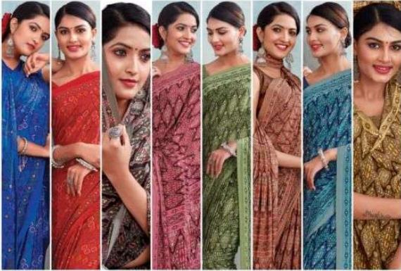
10003E 10003F 10004A 10004B 10004C 10004D 10004E 10004F