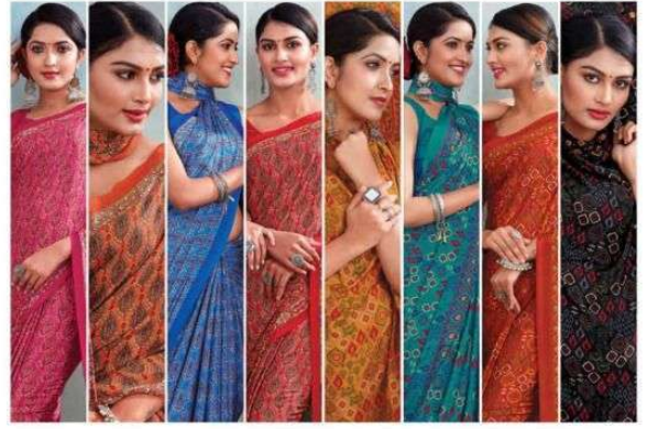
10002C 10002D 10002E 10002F 10003A 10003B 10003C 10003D