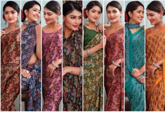
10001A 10001B 10001C 10001D 10001E 10001F 10002A 10002B