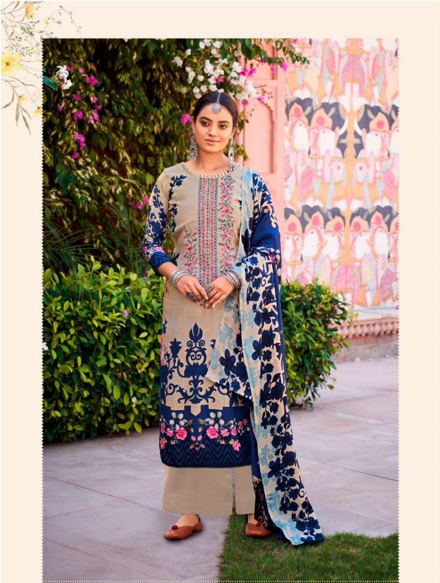
DN | 5014 Dressing is a way of life