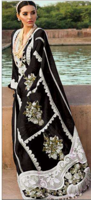
S - 85 G