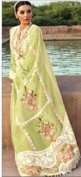
S - 85 F