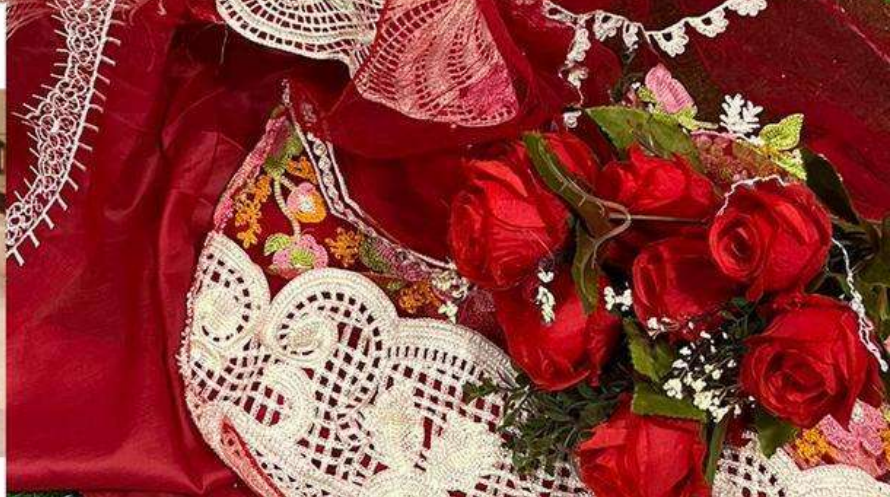
Top - Lawn cotton heavy embroidered with neck emb patch Bottom - Semi lawn cotton