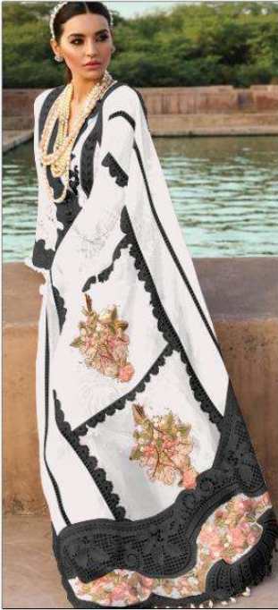
S - 85 E

Top - Lawn cotton heavy embroidered with neck emb patch Bottom - Semi lawn cotton Dupatta - Butterfly net heavy embroidered