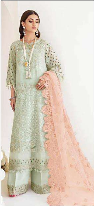
S - 90 A

Top Front Back - Organza heavy embroidered with pearls and gpo lace Inner/Bottom - Heavy santoon with gpo lace Dupatta - Organza heavy embroidered