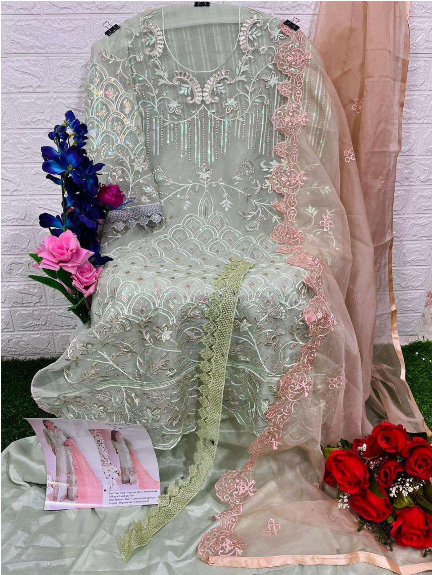
Top Front Back - Organza heavy embroidered with pearls and giza lace Inner Bottom - Heavy tulle with giza lace Dupatta - Organza heavy embroidered