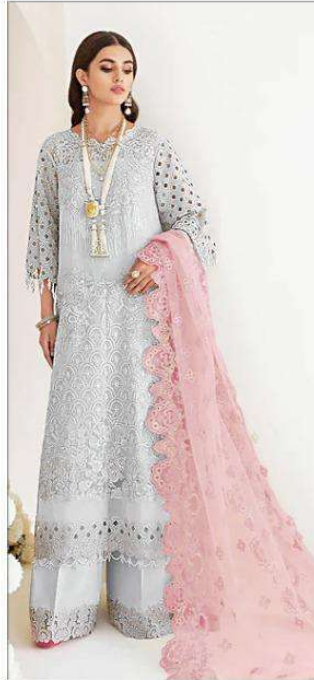
S - 90 B