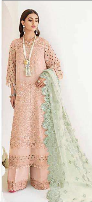
S - 90 C