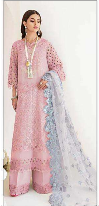
S - 90 D