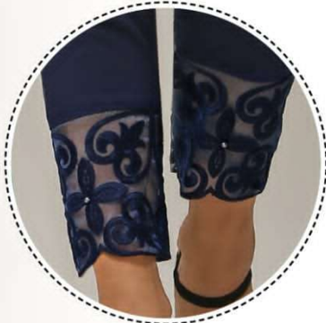
Tissue Embroidery with Matching Pearl

LATEST FASHION • HI-QUALITY • LOWEST PRICE