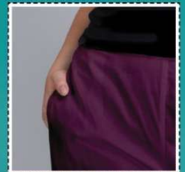
Both Side Pocket