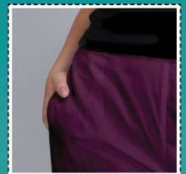
Both Side Pocket