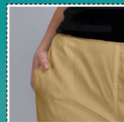
Both Side Pocket