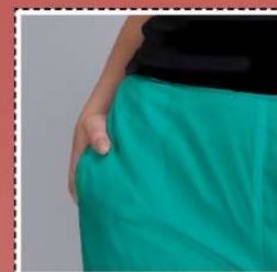
Both Side Pocket