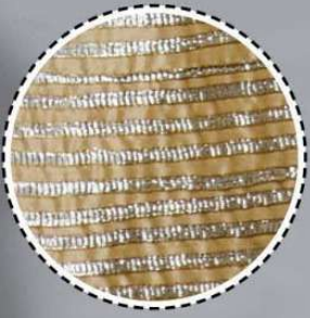
Double Stitched Gota

Size: 34-38 (2XL) • 40-44 (4XL) Length: 38+