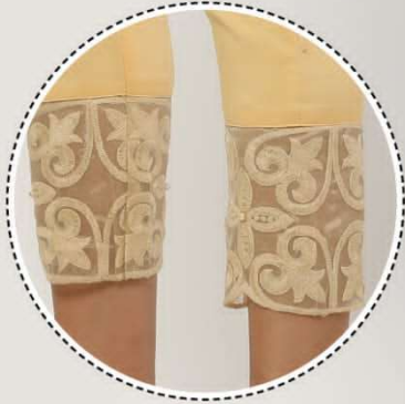
Tissue Embroidery with Matching Pearl