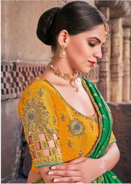
Saree is a wonderful garment that elegantly flatters the curves of a woman