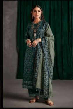
CO DE 7476