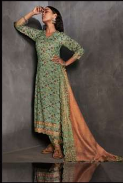
CO DE 7473