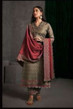
CO DE 7475