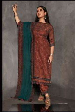
CO DE 7477