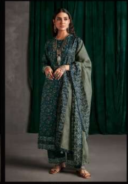
CO DE 7476