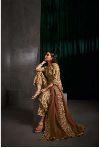
Decorated organza with an ethnic edge