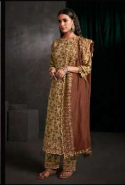
CO DE 7478