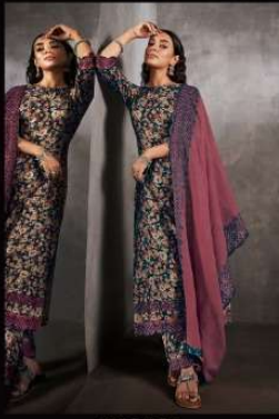
CO DE 7471