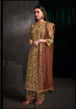
CO DE 7478