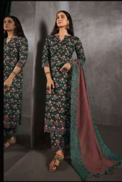
CO DE 7474