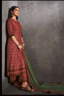
CO DE 7472