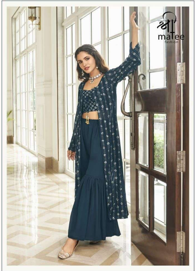
My fashion is about the urban woman in the year. I think about obscure, weird things and try to create a world around them