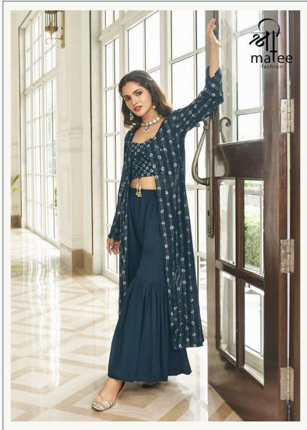
My fashion is about the urban woman in the year. I think about obscure, weird things and try to create a world around them