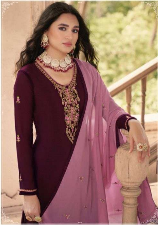
MATCHLESS STYLE, AMAZING WORK DETAILS AND A DASH OF TRADITION. WHAT ELSE YOU NEED TO FLAUNT ON THIS FESTIVE SEASON?