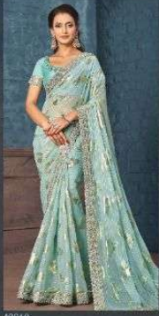
42610 FABRIC : Georgette Zari Jacquard