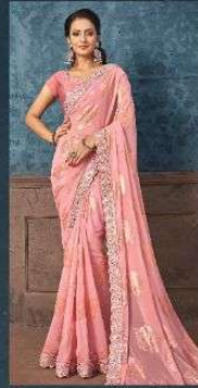
42613 FABRIC : Georgette Zari Jacquard