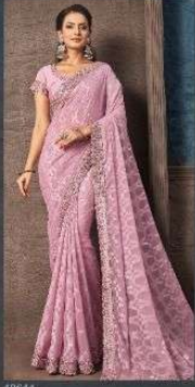
42611 FABRIC : Georgette Zari Jacquard