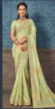
42614 FABRIC : Georgette Zari Jacquard