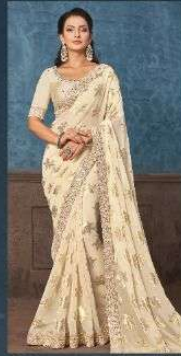
42612 FABRIC : Georgette Zari Jacquard