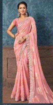
42613 FABRIC : Georgette Zari Jacquard