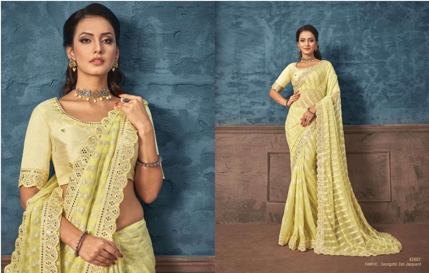
42607 FABRIC : Georgette Zari Jacquard