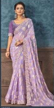
42608 FABRIC : Georgette Zari Jacquard