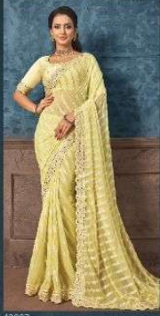
42607 FABRIC : Georgette Zari Jacquard