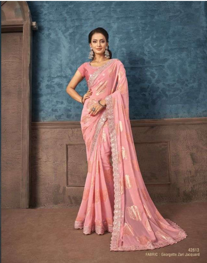
42613 FABRIC : Georgette Zari Jacquard