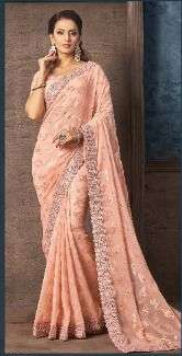
42606 FABRIC : Georgette Zari Jacquard