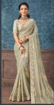
42609 FABRIC : Georgette Zari Jacquard