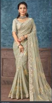
42609 FABRIC : Georgette Zari Jacquard