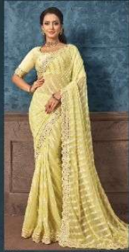
42607 FABRIC : Georgette Zari Jacquard