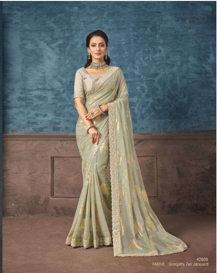
42609 FABRIC : Georgette Zari Jacquard