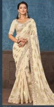
42612 FABRIC : Georgette Zari Jacquard