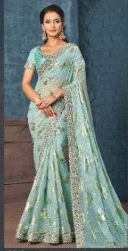
42610 FABRIC : Georgette Zari Jacquard