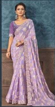
42608 FABRIC : Georgette Zari Jacquard