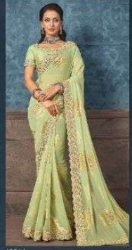
42614 FABRIC : Georgette Zari Jacquard