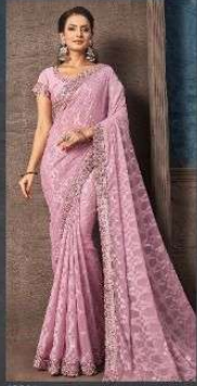
42611 FABRIC : Georgette Zari Jacquard