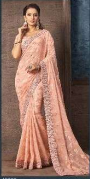
42606 FABRIC : Georgette Zari Jacquard