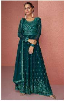
◆ 9394 ◆