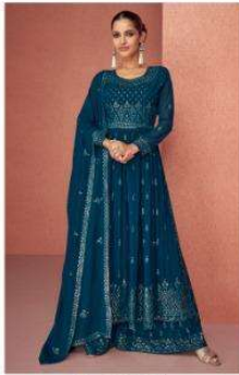
◆ 9396 ◆