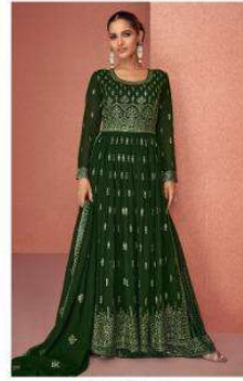
◆ 9398 ◆