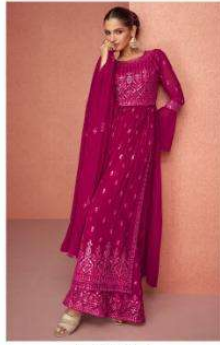
◆ 9395 ◆