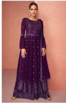
◆ 9397 ◆