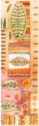
Indian Heritage Patola

HOW DO YOU PERCEIVE EXCELLENCE IN PROFESION & IN LIFE? SHEAT AGE TO TOP BANARASI THREADS THIS SEASON.