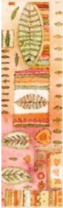
Indian Heritage Patola

HOW DO YOU PERCEIVE KASHMIRI? POOR, THE KING'S LOVE! SHEETS ARE TO GO BANARAS TREASURES THE MARCH