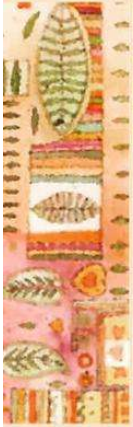
Indian Heritage Patola

HOW DO YOU PERCEIVE FASHION IN YOUR OWN COUNTRY? LIVE IT TIGHT AND TO THE BARRICADES TRENDS THIS SEASON.