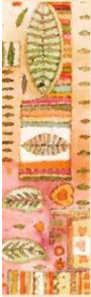
Indian Heritage Patola

HOW DO YOU PERCEIVE YASHHONTHI POPULARITY LEVELS? WHAT ARE TO DO WAREHEAD TRENDS? THE SEARCH