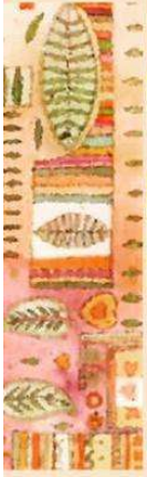
Indian Heritage Patola

HAND MADE WITH FINEST PATOLA IN PROFUSION AND LAYERS SHAWT AND TOP BANARASI THREADS THIS SEASON