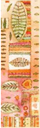
Indian Heritage Patola

HOW DO YOU PERCEIVE AMBITION IN PEOPLE'S DAILY LIVES? WHAT ARE THE UPWARD TRENDS THIS BRANCH?