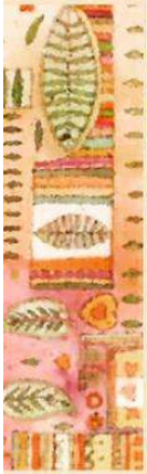
Indian Heritage Patola

HOW DO YOU PERCEIVE YOUR OWN PROPER DAILY LIVES? WHAT ARE THE OF BANARAS TREND? THE BANARSI