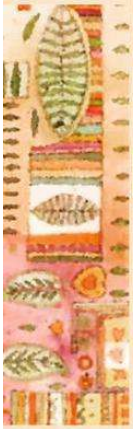
Indian Heritage Patola

HOW DO YOU PERCEIVE FASHION IN PROFANE DAILY LIFE? WHAT ARE THE BANGALAHI TRENDS THIS SEASON?