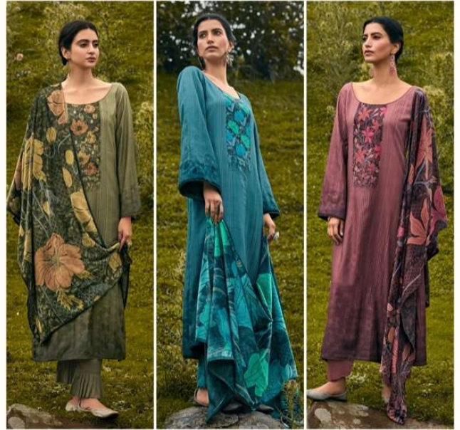
• 1004 •