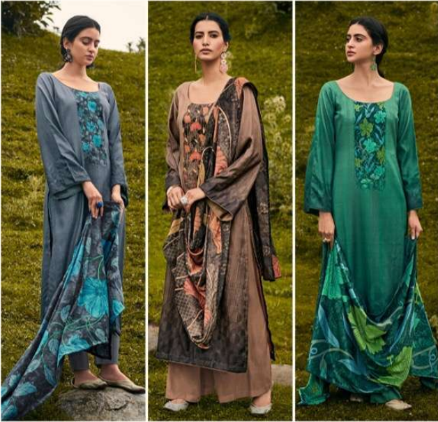
• 1001 •