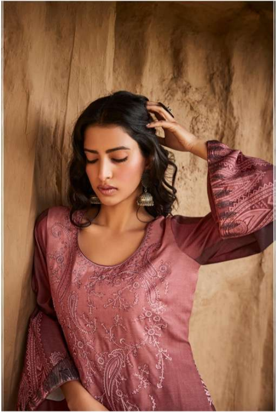
THE MYSTIC / BEAUTY 1006 ▲