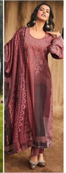
▲ 1006 ▲