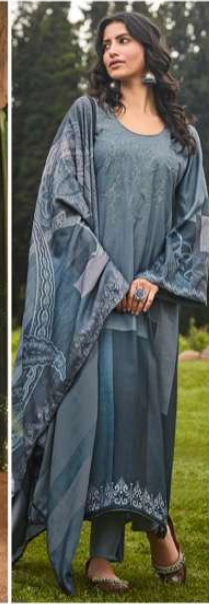
▲ 1005 ▲