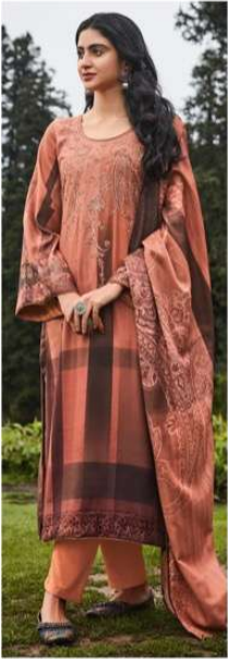
▲ 1001 ▲