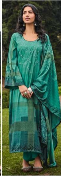
▲ 1003 ▲