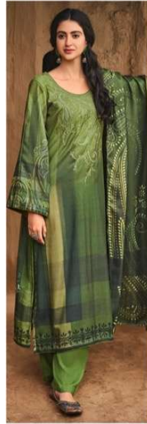
▲ 1004 ▲