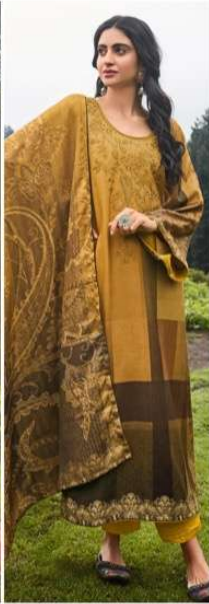
▲ 1002 ▲