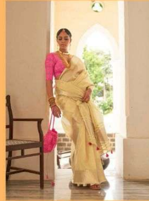
D. No. 2035