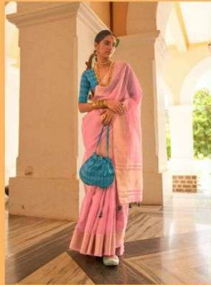
D. No. 2034