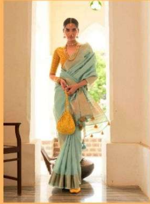
D. No. 2032