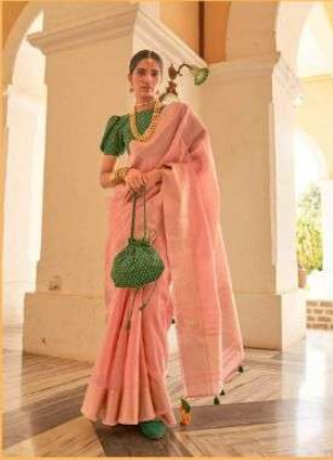
D. No. 2031