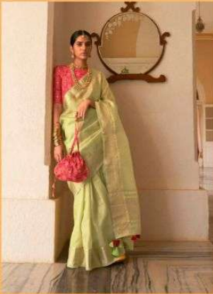
D. No. 2033