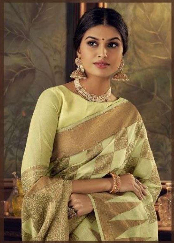
Fun with fabric for the feminine in you.