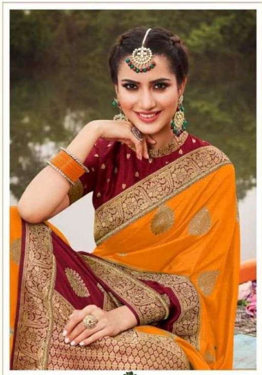
The glimmer in something worn will fulfill all the requirements for glimmer if ready look.