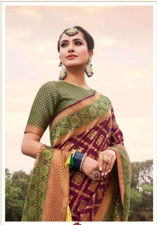
everything you need to extract your festive wardrobe from. Discover designs to the color season of the season.