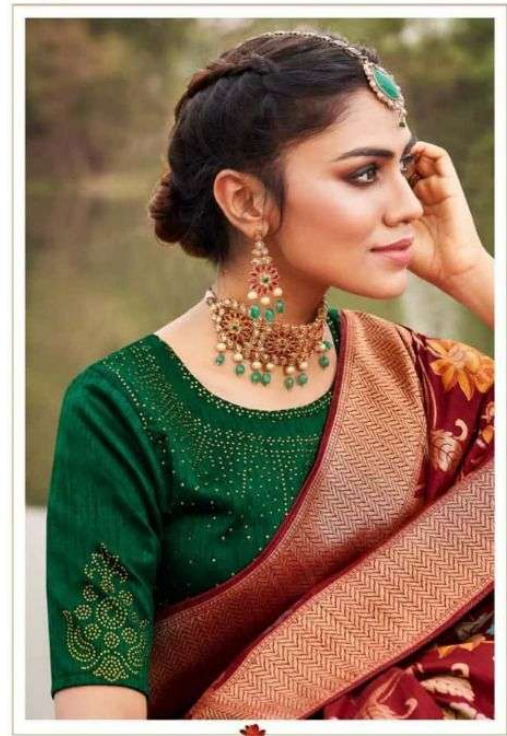
Brilliant hues of traditional sarees give you a new makeover this season.