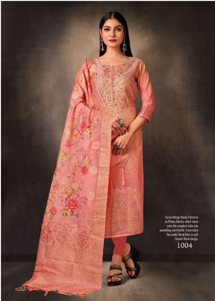
Same Rangey Flaky Patterns on Finest fabrics which turns even the simplest style into something worthwhile. Experience the exotic Royal bliss to soft blush floral design.