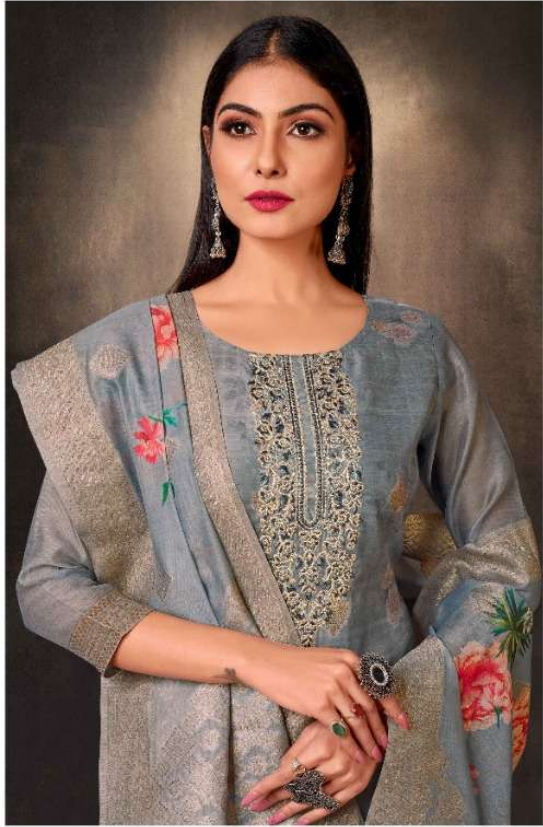
● COLLECTION EVERGREEN