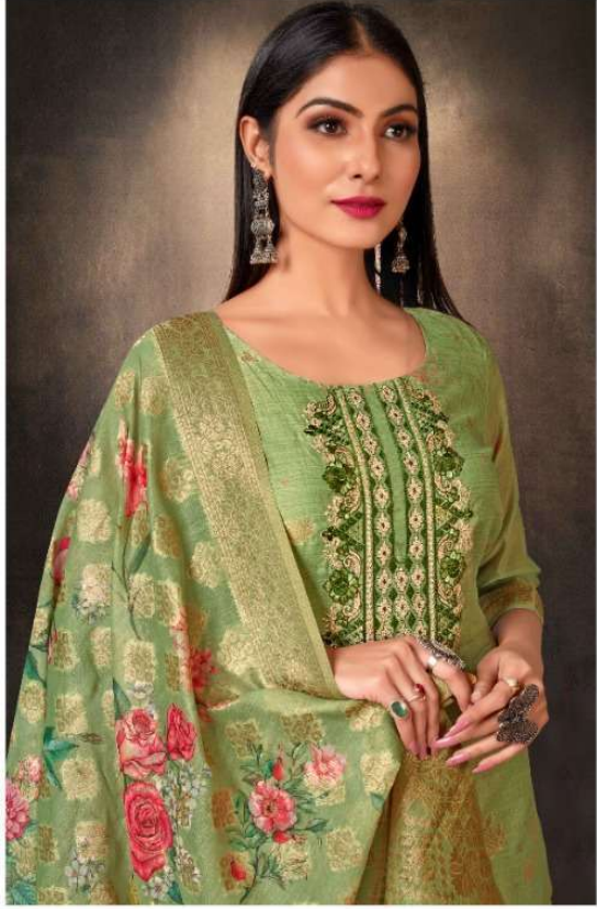
● COLLECTION EVERGREEN