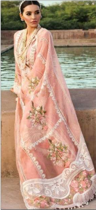
S - 85 A

Top - Lawn cotton heavy embroidered with neck emb patch Bottom - Semi lawn cotton Dupatta - Butterfly net heavy embroidered