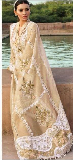
S - 85 B