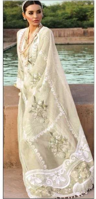
S - 85 D