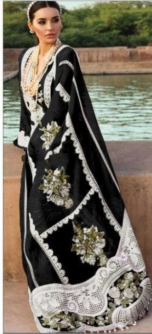
S - 85 C