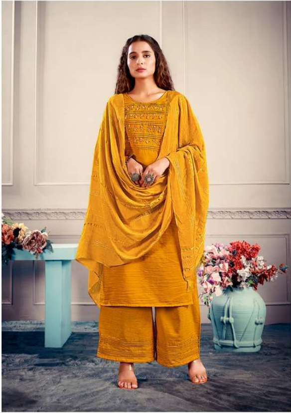
D.no . 1002