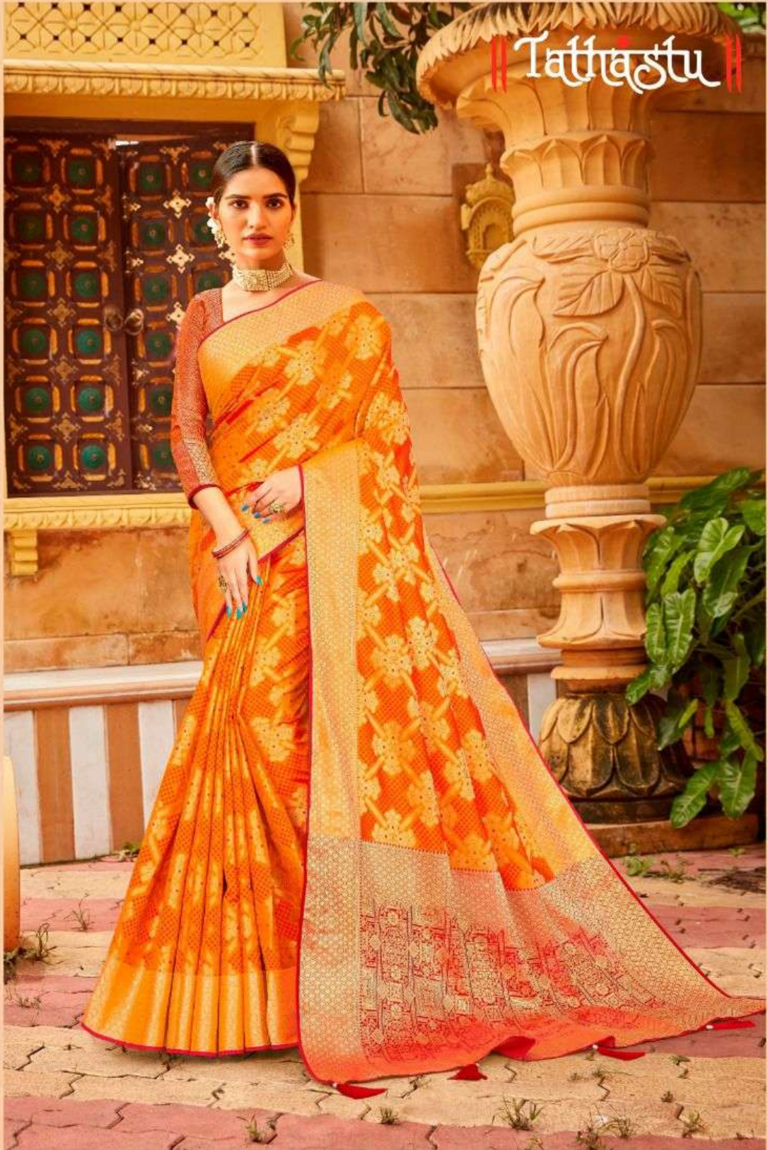
DESIGN NO. TN-57-C