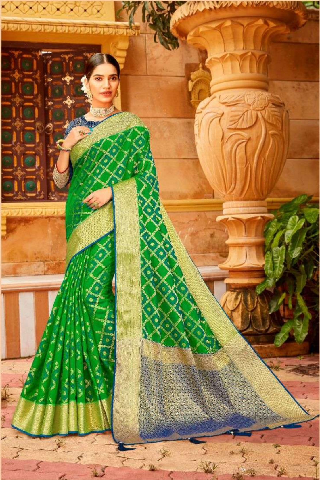
DESIGN NO. TN-58-B