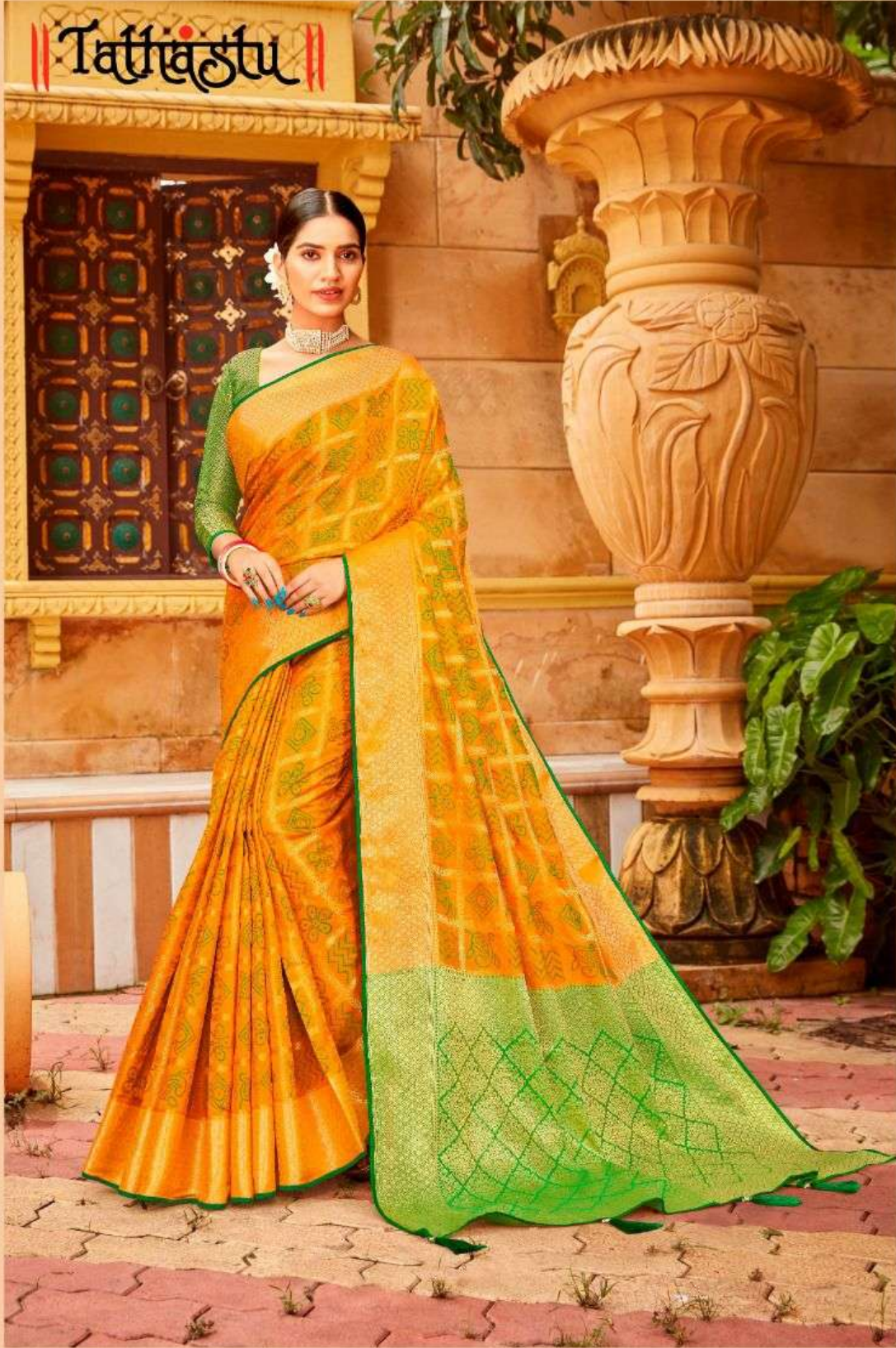
DESIGN NO. TN-59-B