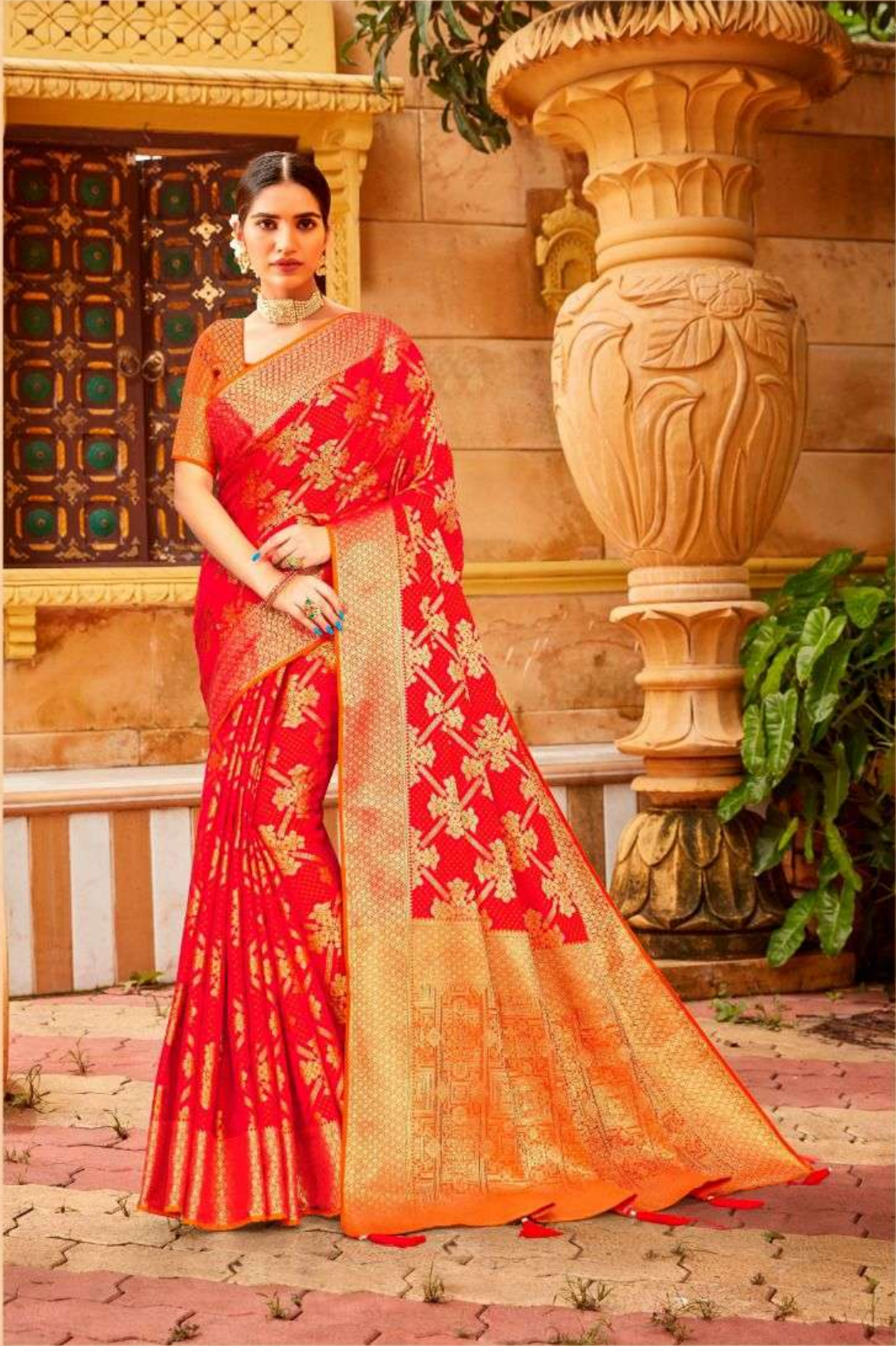
DESIGN NO. TN-57-B