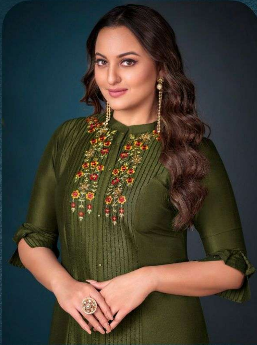
colour - megenta cloth - modal silk