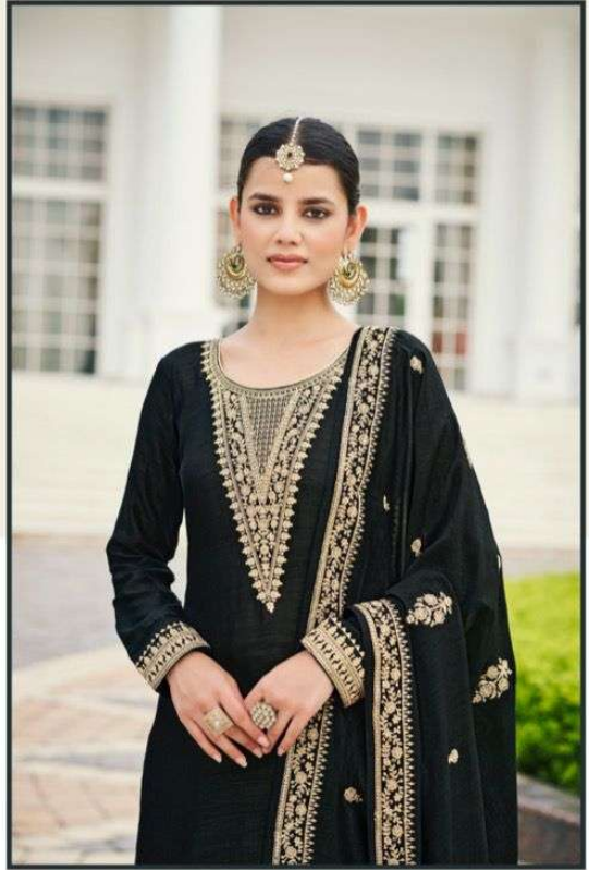
Evocative of a confident elegance without being overly feminine, this stylish outfit is instant classic.