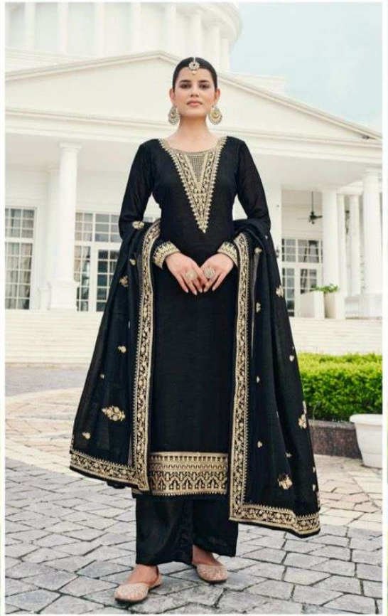
Evocative of a confident elegance without being overly feminine, this stylish outfit is instant classic.