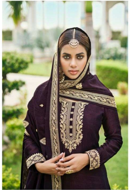
The new age style calls for a change in trend. Ditch heavy embroidery for delicate embellishments on the lighter-than-air dress.