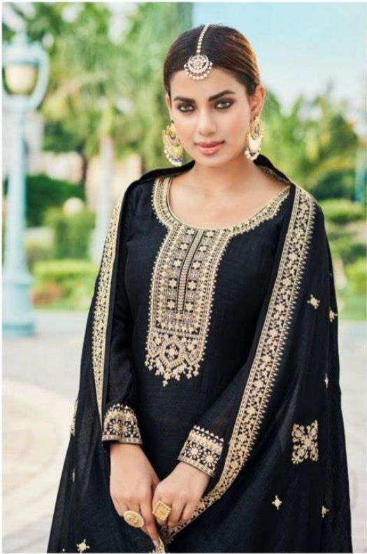
Let your charm spread the magic while you dress up and flaunt!