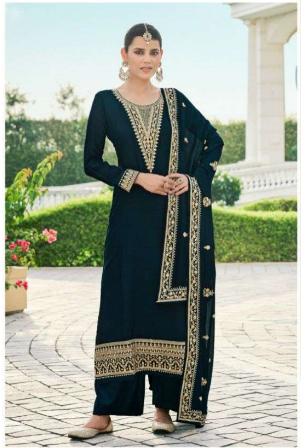
It is you, the head turner keeping everything classy and graceful! -106-