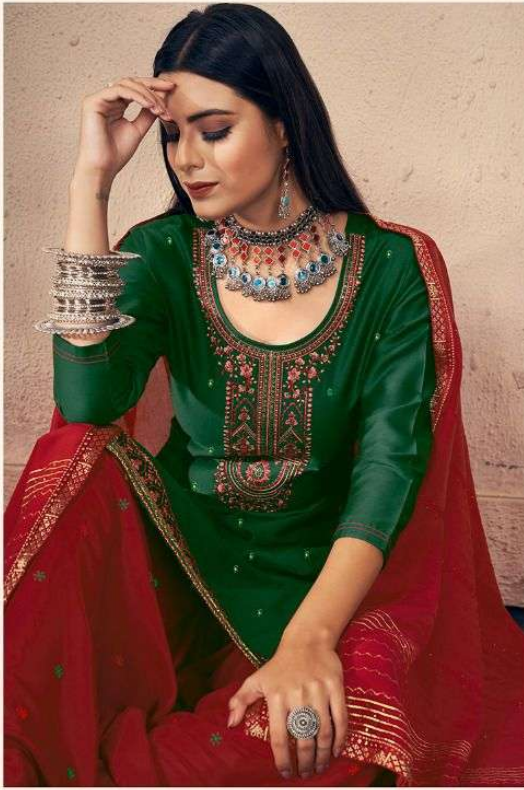
The key is to contrast two elements so you don't end up over doing the feminine quotient