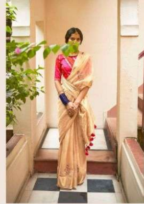
D. No. 2015

A SENSE OF VERSATILITY AND AN EPILOGUE OF SERENITY