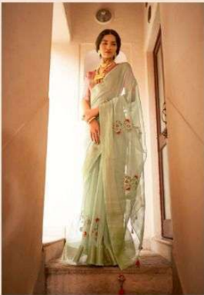
D. No. 2013