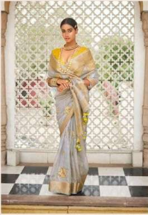
D. No. 2011