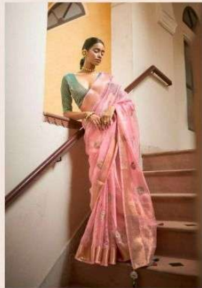
D. No. 2014