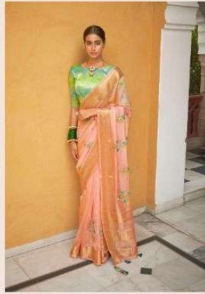
D. No. 2012