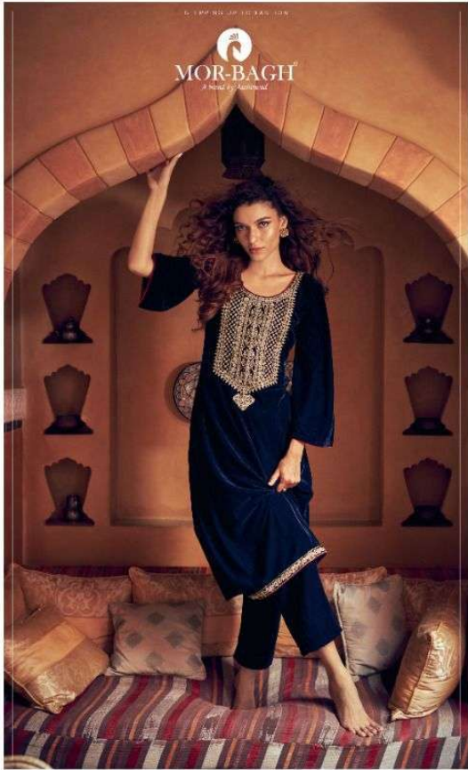
RJ | 9373