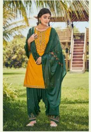
●● D.NO \ 13321