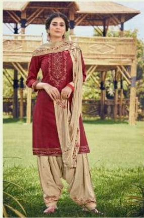
●● D.NO \ 13319