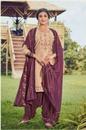
●● D.NO \ 13318