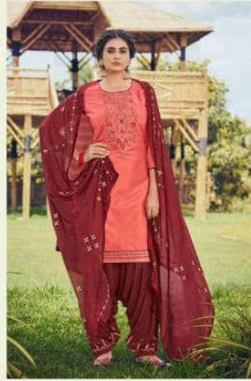
●● D.NO \ 13320