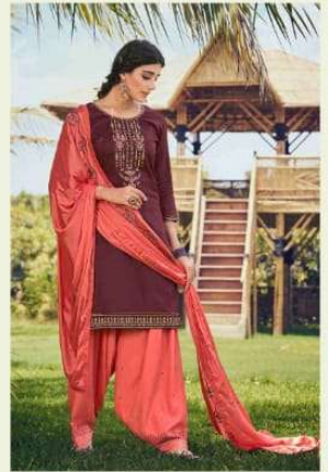
●● D.NO \ 13323