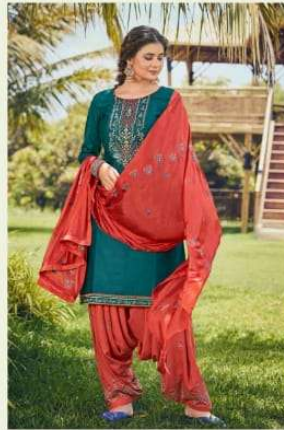
●● D.NO \ 13322