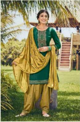
●● D.NO \ 13316