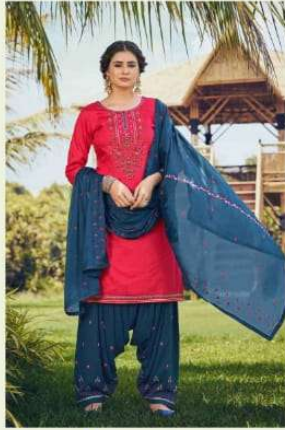
●● D.NO \ 13317