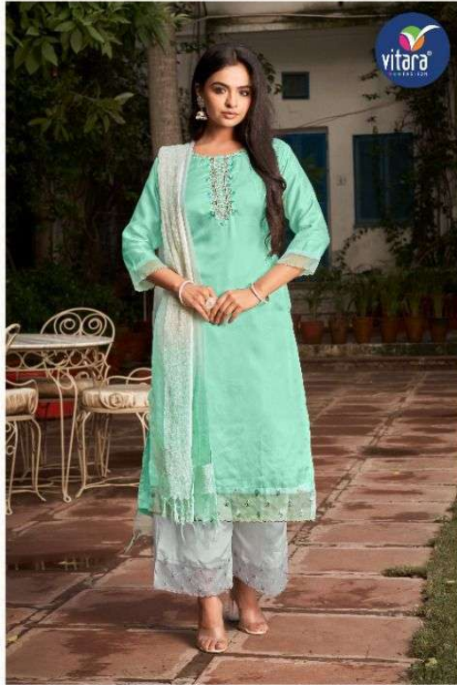
A woman is never sexier than when she is comfortable in her clothes.