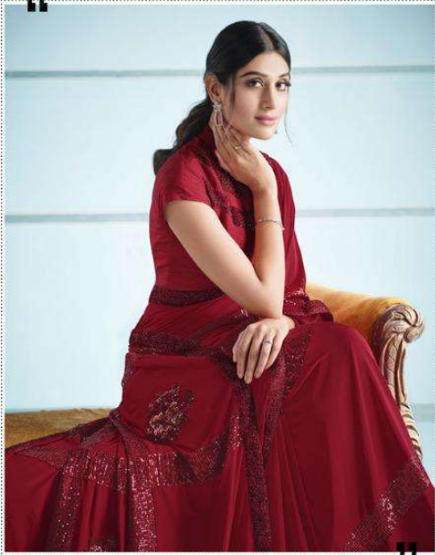
A Queenly shade of Red with a never-like-before checkered sequin placement with applique floral.