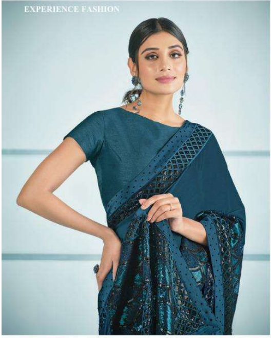
A trendsetting teal blue shade with absolutely astounding geometrical sequined embroidery in similar shades.