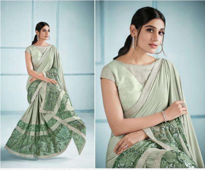
A beautiful pastel green saree with subtle sequins embroidered placements for a dreamy appeal.