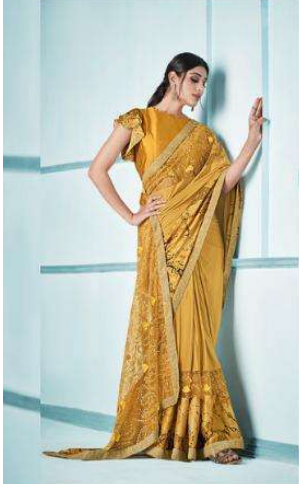
Make way for the freshest color of the season – Mustard Yellow, enhanced with abstract marble prints, sequins and 3D details.