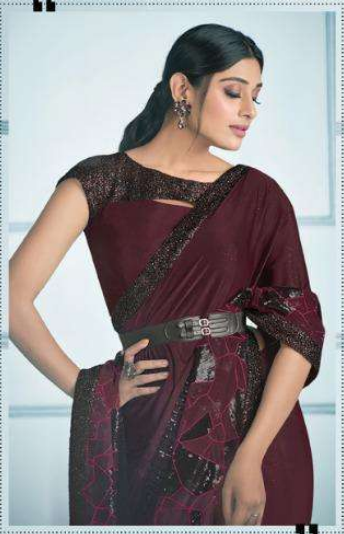
Deep shade of wine adorned with hints of abstract black sequins for a diva-esque appeal