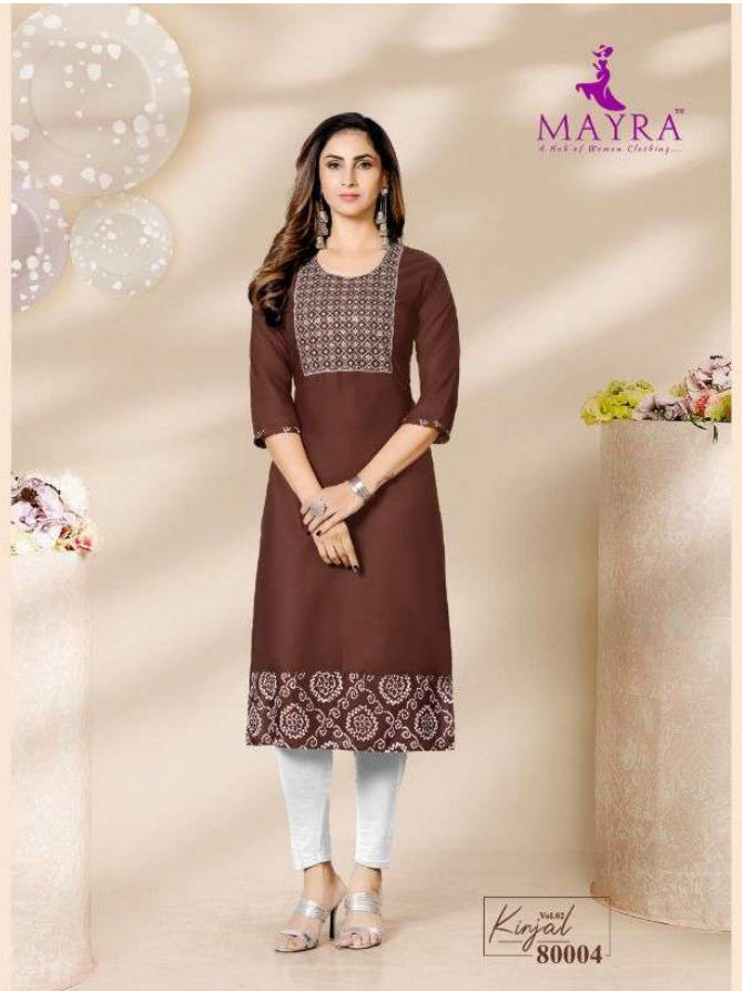
this stands as a classic example of the attire that will make everybody fall head over heels in love with fashion. a piece that makes a statement without having to say a word