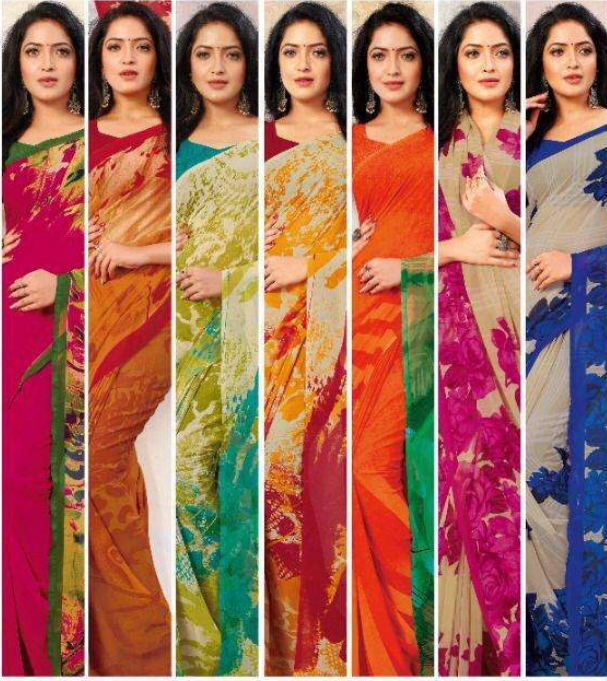
57001A 57001B 57002A 57002B 57003 57004A 57004B