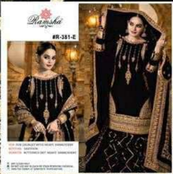
Emb Net Bottom