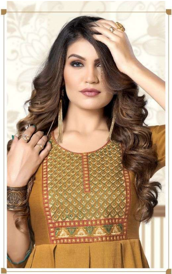
ETHNIC SENSE Turn every head your way as you stroll across in an outfit from the new gorgeous collection, celebrate your classy side with this perfect concoction of chic style