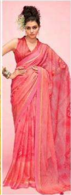
• 11887 •