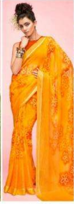
• 11883 •