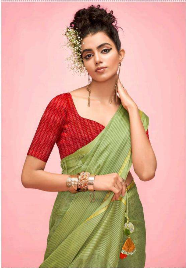
THE EXQUISITE a design for a charming women • 11882 •