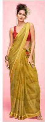
• 11885 •