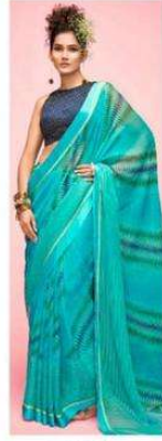
• 11881 •