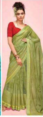
• 11882 •