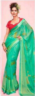
• 11888 •