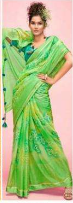
• 11884 •