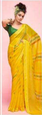
• 11886 •