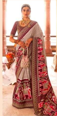
R-108 F (EMB-BR-BP)