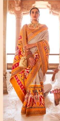
R-108 G (EMB-BR-BP)