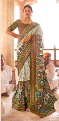
R-108 B (EMB-BR-BP)