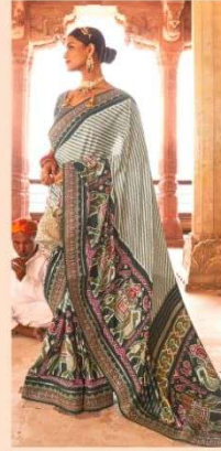
R-108 E (EMB-BR-BP)