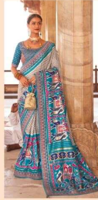
R-108 D (EMB-BR-BP)