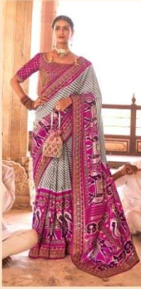
R-108 A (EMB-BR-BP)