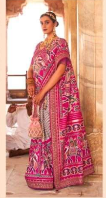
R-108 I (EMB-BR-BP)