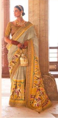
R-108 C (EMB-BR-BP)