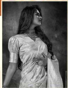
Shop the sarees this season and opt for a more traditional vibe. An off-the-beat gift option for a woman to look elegant and graceful in her, with excellent design, high-quality fabrics and genuine craftsmanship.