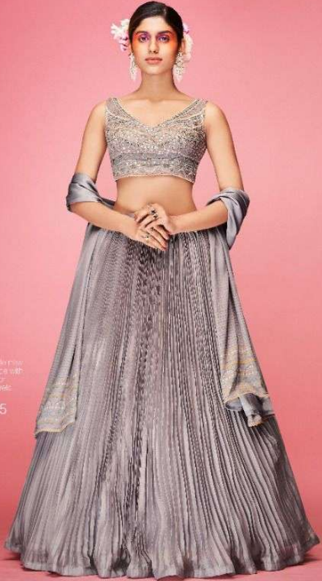
Flare in a wide border area of sequins with a laser fringe on edge, with 300000s.