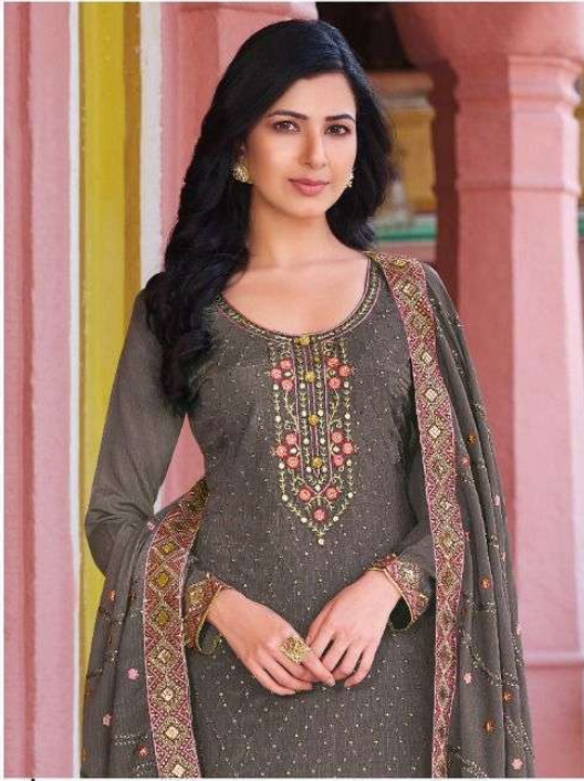
4986 Classic styles with Luxurious soft fabrics are highted by refined and feminine details