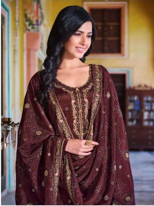
4981 Simple without letting so of elegance & tradition with natural fabrics