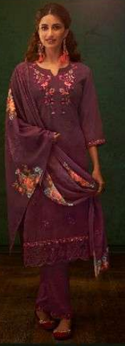
NO | 1652