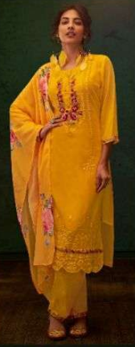
NO | 1653