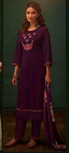
NO | 1656