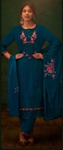
NO | 1651