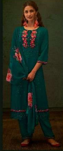
NO | 1654