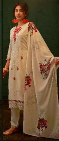
NO | 1655