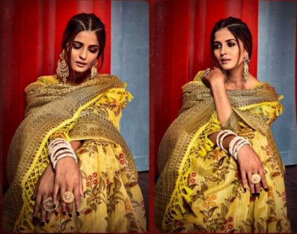
One of the elite designer-wears in rare bright color combination.