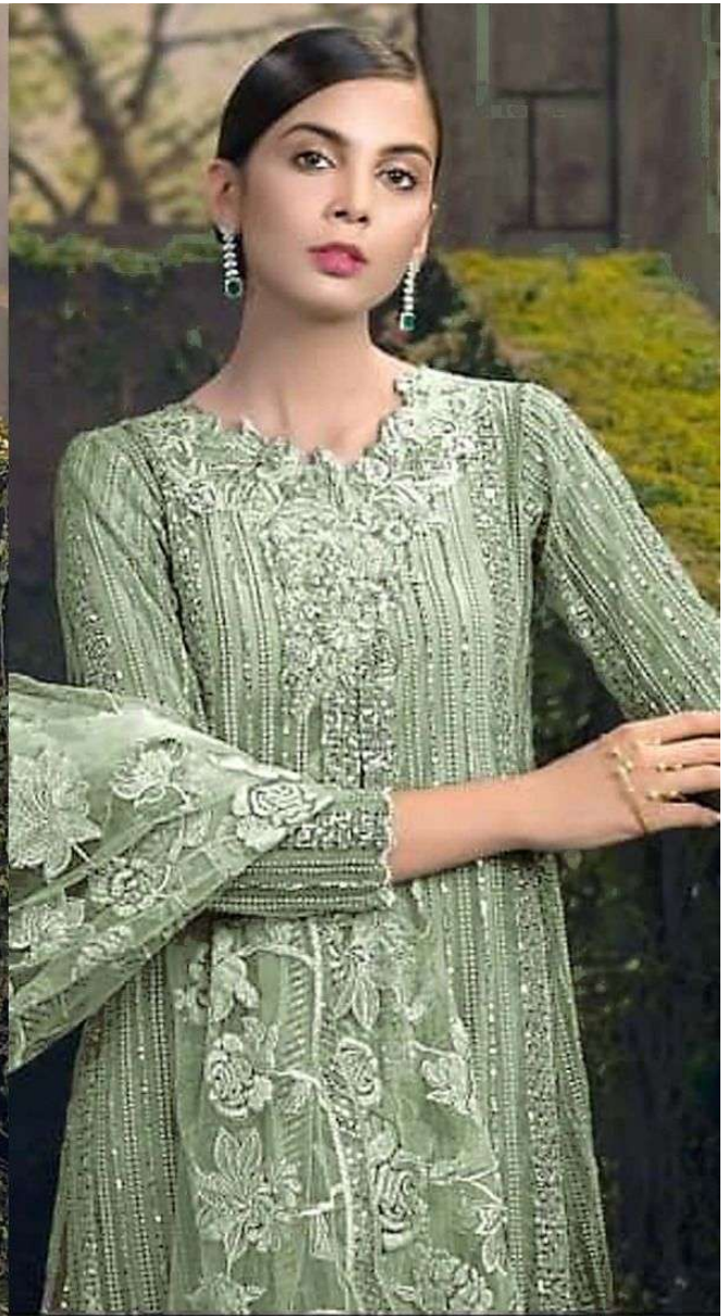
Top - Butterfly net heavy embroidered with lace neck patch Inner Bottom - Heavy santoon Dupatta - Butterfly net heavy embroidered