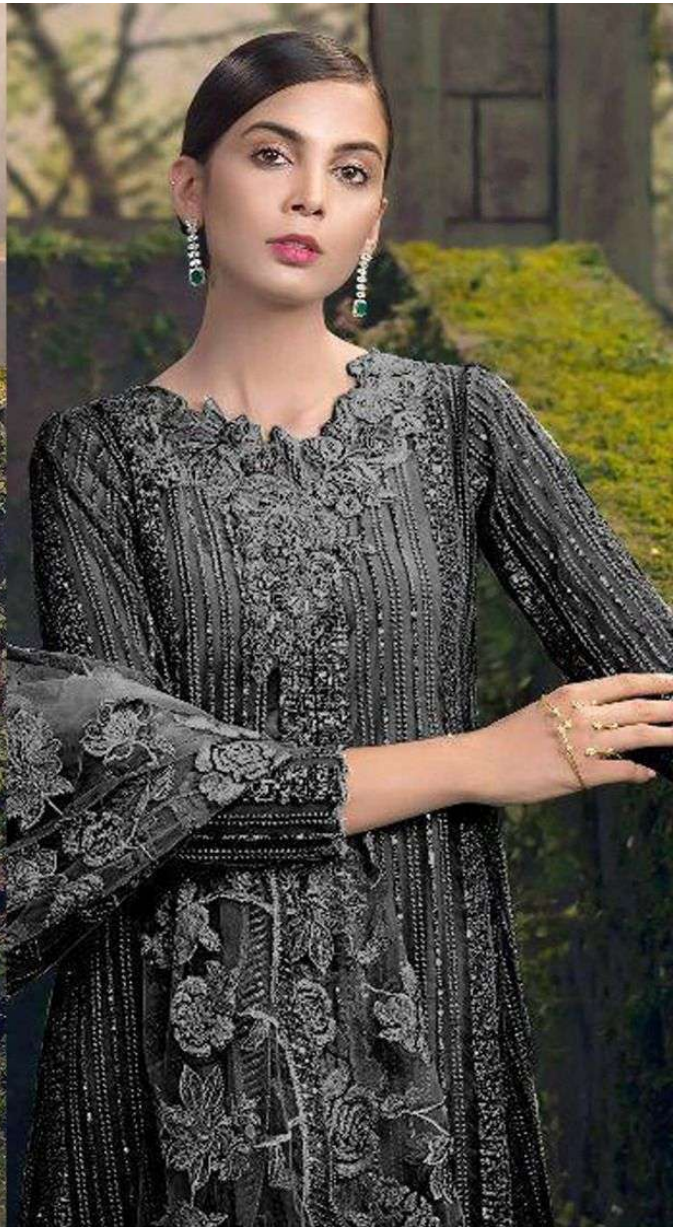
Top - Butterfly net heavy embroidered with lace neck patch Inner Bottom - Heavy santoon Dupatta - Butterfly net heavy embroidered