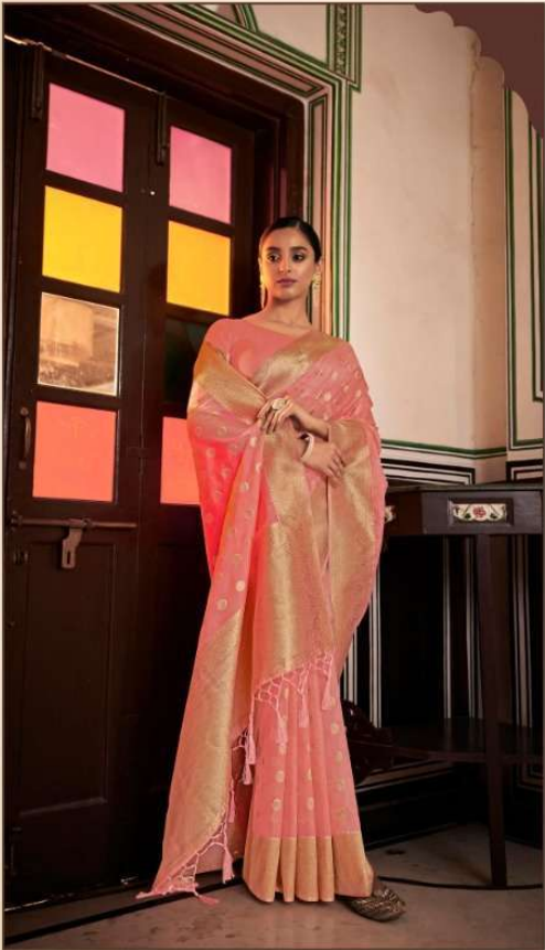
"A woman's saree should be like a beautiful face: every its purpose makes interesting the view."