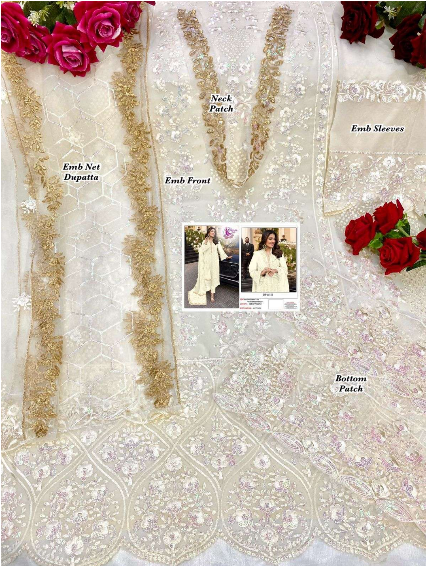
Emb Net Dupatta